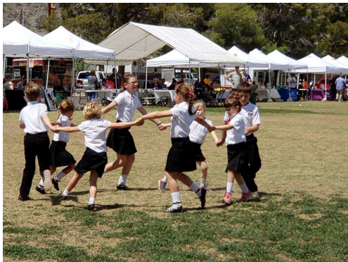
Irish Dancers entertained the crowds at ‘Slope Fest. McTeggart School of Irish Dance