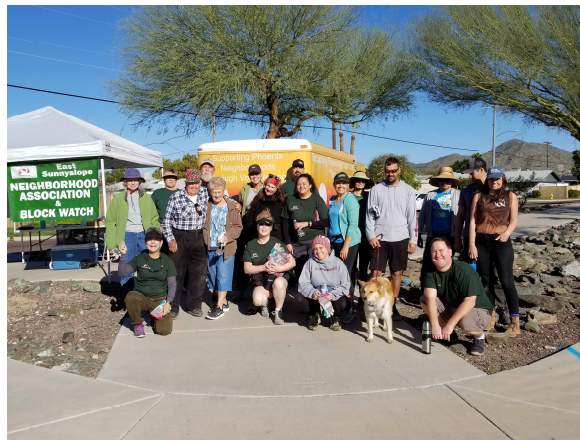
ESSNABW partnered with Desert Botanical Garden and planted 80 plants to help the Monarch Butterfly population!