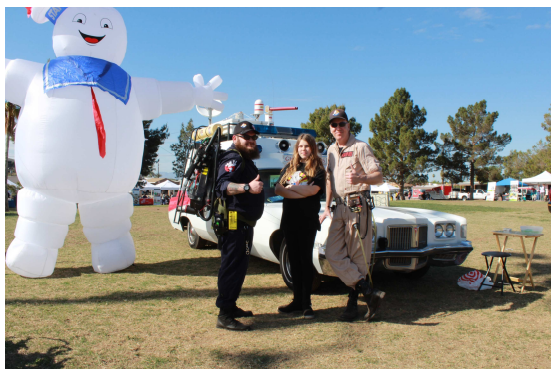
Ghost Buster’s Display Vehicle at ‘Slope Fest! I ain’t afraid of no ghost!