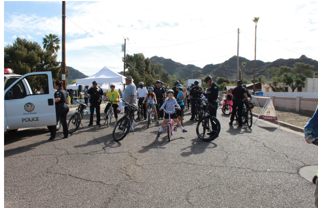
Above: Tour de Sunnyslope Family Friendly Bike Ride!