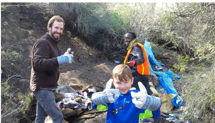
ESSNABW partners with Norton Vista NA for a cleanup - and boy was it a mess! (Above) Look at our full trailer! (Below)

‘SLOPE FEST • CLEANUPS • MEETINGS • VOLUNTEERING