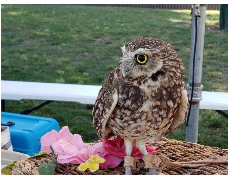
Fallen Feathers joined us at ‘Slope Fest this year. They brought many beautiful birds and taught the crowds all about them.