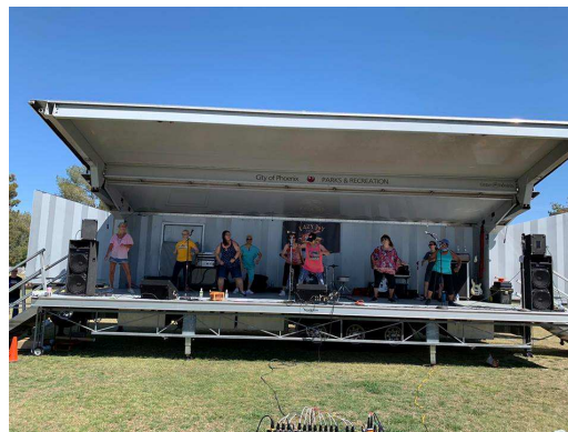
The Sunnyslope Community Center offers Zumba for Seniors. Check it out!