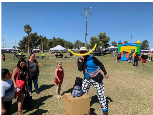
The Kids Zone at ‘Slope Fest!